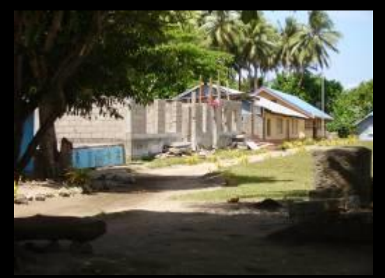
New classrooms for Sangalai School under construction