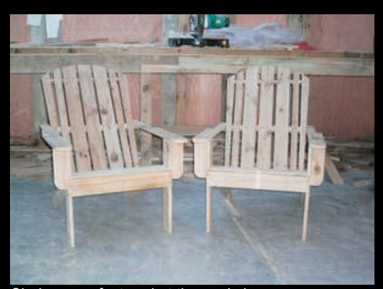
Chairs manufactured at the workshop