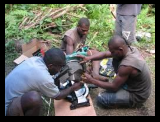
Inspecting just-arrived drop saw

So to all of you who contributed tools to this project, thank you so much again for making a positive difference to the people of the Maskelynes. You have all been incredibly generous.